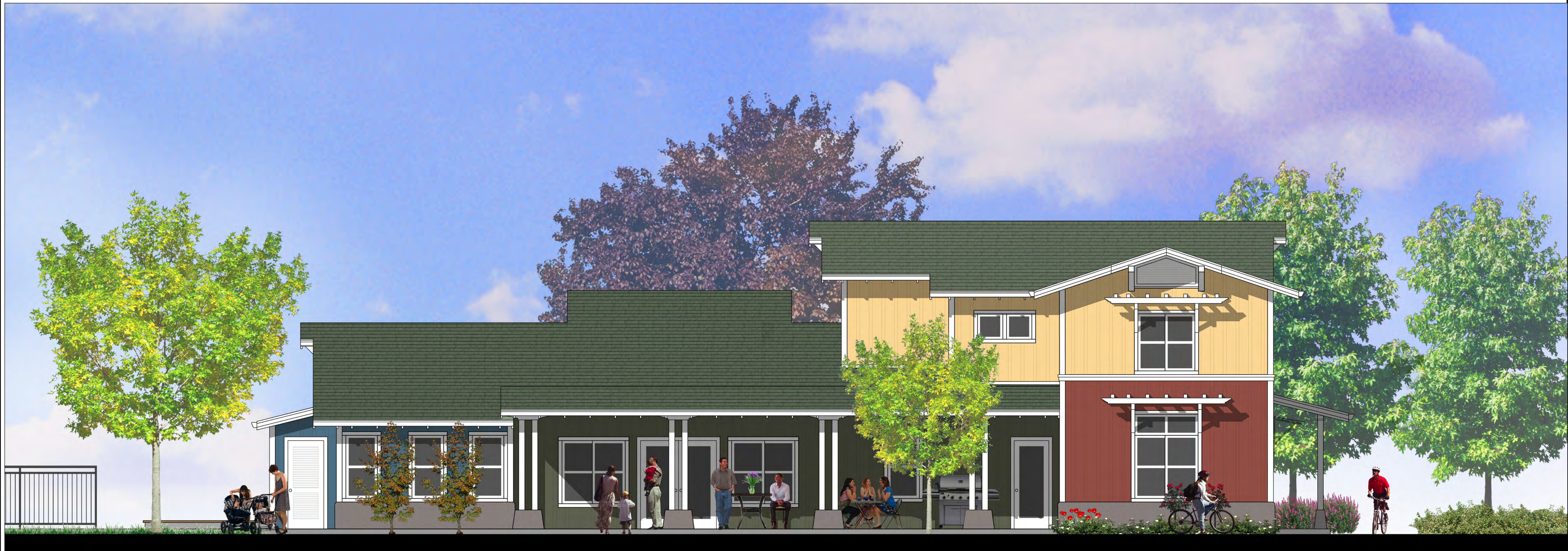
1 WEST ELEVATION Scale: 1/4"=10' (@24"x36" PAPER SIZE)