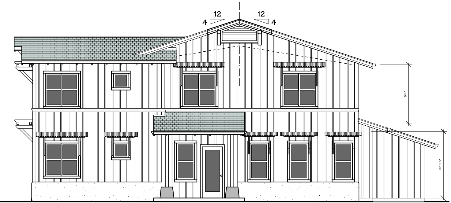
2 SOUTH ELEVATION Scale: 1/4"=10' (@24"x36" PAPER SIZE)