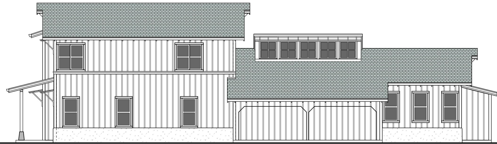
3 EAST ELEVATION Scale: 1/4"=10' (@24"x36" PAPER SIZE)